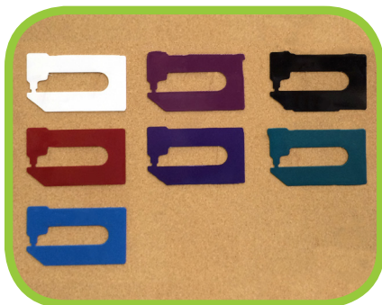
High Gloss Custom Paint Colors

Professional packages include machine, frame, needles, bobbins, bobbin winder, oil, patterns, clamps, leaders, product manuals, and 5-year warranty. Additionally, Nolting offers exceptional services such as delivery, package installations, and superior professional training.