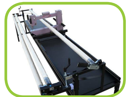
Nolting Commercial Steel Frame