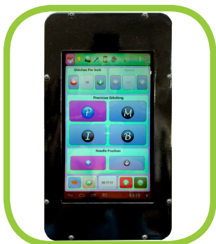
New NV Touch Screen Stitch Regulator