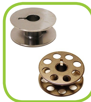
"L or M" bobbin